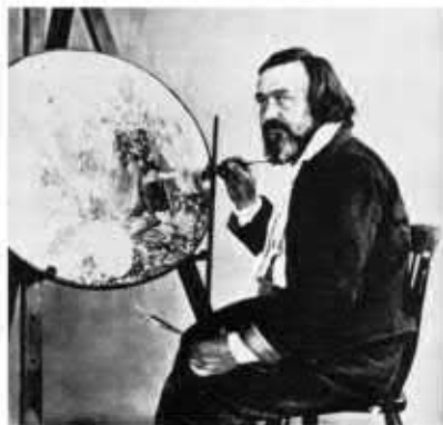
Richard Dadd 1817 - 1886

In 1986 a couple took a watercolour to the Antiques Roadshow. They were about to move it to the shed while they redecorated the lounge, but changed their mind when they discovered it was 'The Halt in The Desert', a painting which had been missing since 1857. It was sold to the British Museum a year after the programme for £100,000.