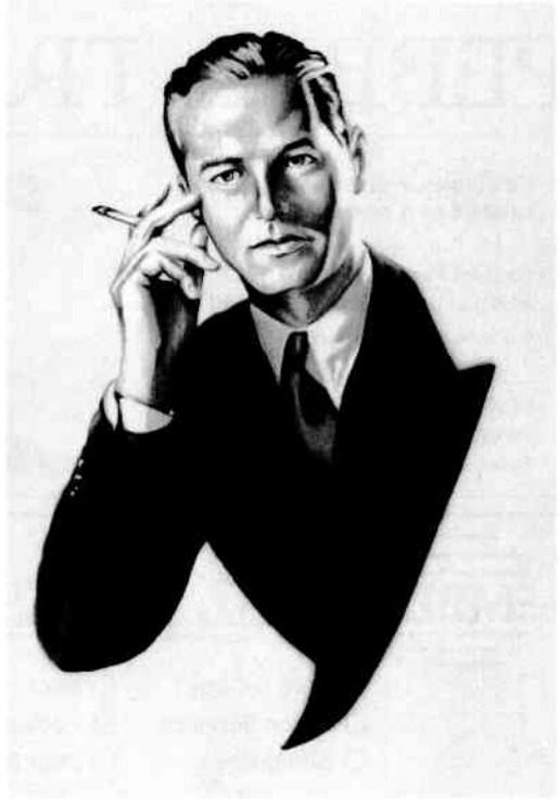
Terence Rattigan

'Bloody Lies' is a tense crime drama featuring love, affairs of the heart, deceit, trauma and ultimately murder. James Long finds himself accused of bludgeoning to death the woman he has been having an affair with. Tormented by guilt and loss of memory has he been wrongly convicted? Can any of the characters be trusted? 'Teen Twister' is a light-hearted response to the question, 'what is it like being a teenager in 2017?' Witness their concerns, stereotypes, contemporary pressures all re-imagined with a sense of play and humour.